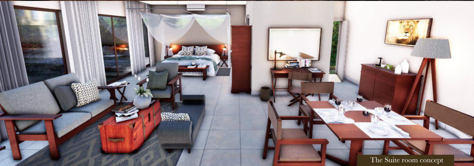
The Suite room concept

A major refurbishment programme is under way at Hwange Safari Lodge, one of Zimbabwe's most well-established resort hotels, situated just outside the world-famous Hwange National Park.